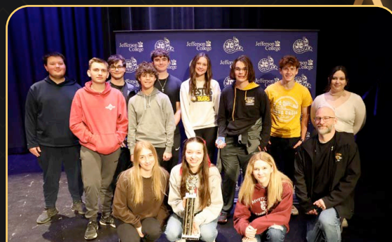
High School Team - 1st Place, Festus