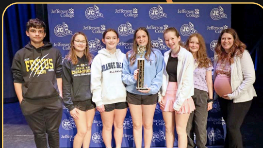
Junior High Team - 1st Place, Festus