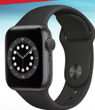
Apple Watch Series 6 /40mm GPS