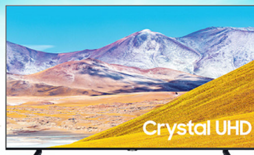
43" Samsung UHD 4K Smart TV