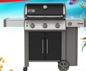
Weber Genesis II E-315 Propane Grill