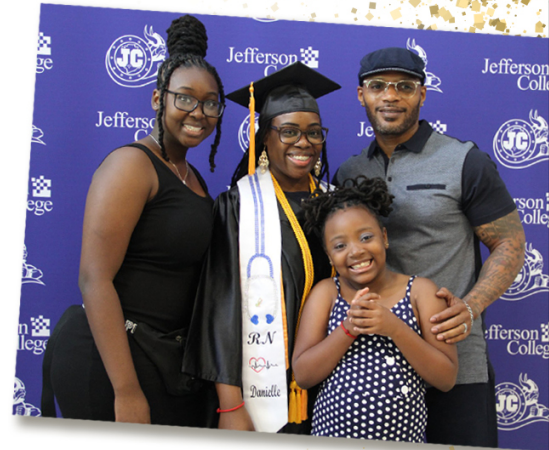
Photo backdrops will be set up in the Field House; please stop by during any of the dates below.

We invite the Class of 2020 back to campus for an optional photo-op!