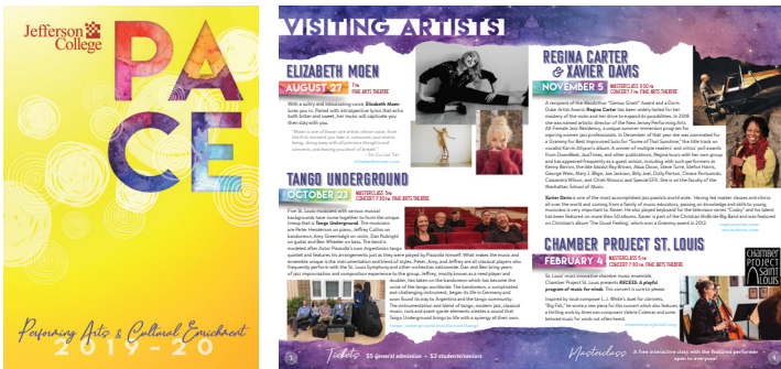
Book or Specialty Publication Performing Arts and Cultural Enrichment (PACE) Series Booklet - Gold