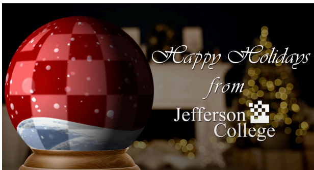
E-Card “2019 Holiday Greeting” – Gold