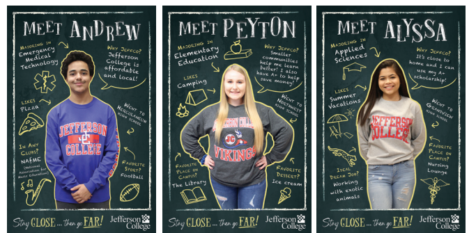
Postcard “High School Series” – Gold