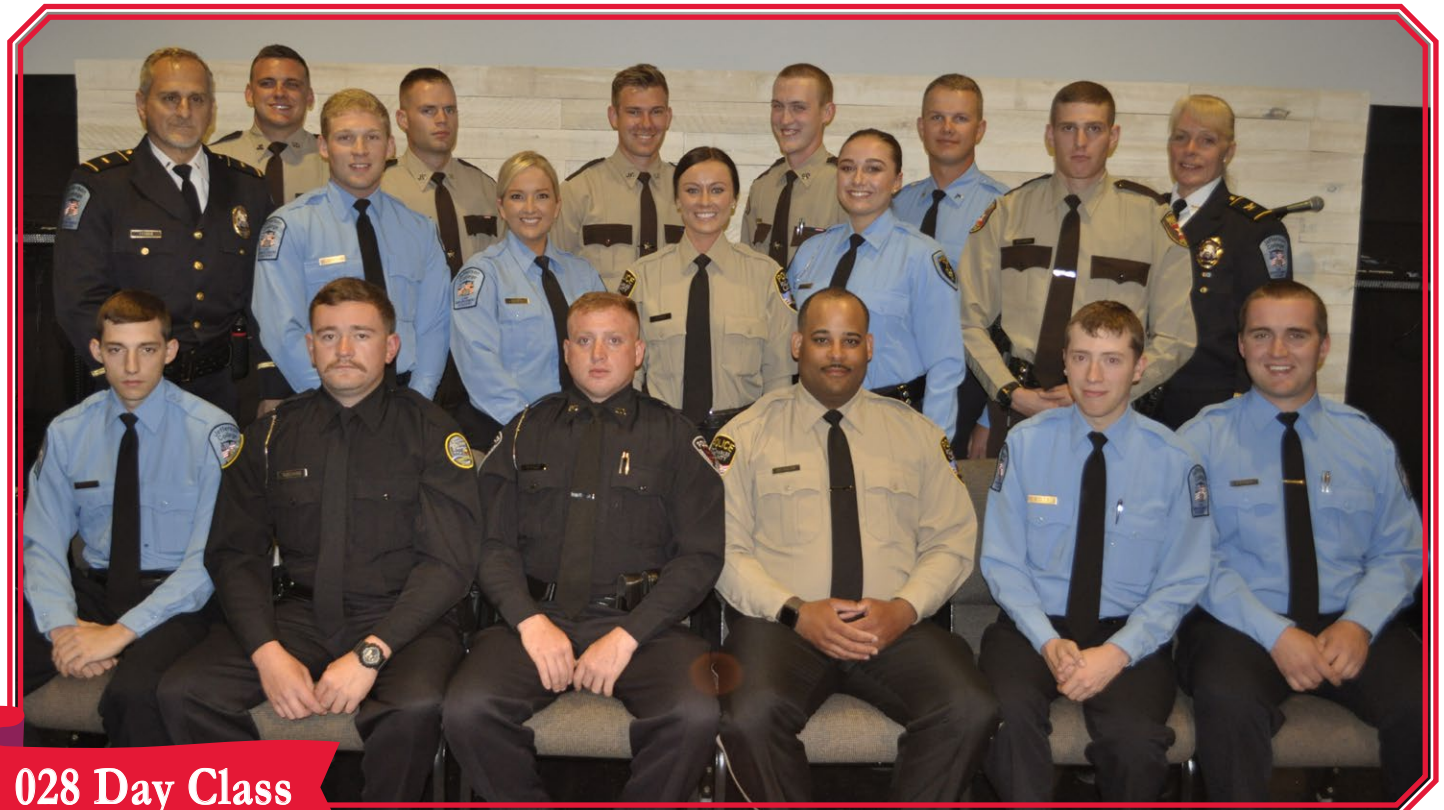
028 Day Class