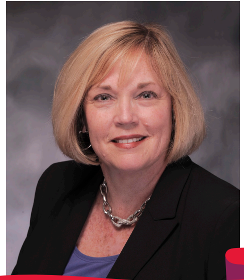
2018 Alumnus of the Year